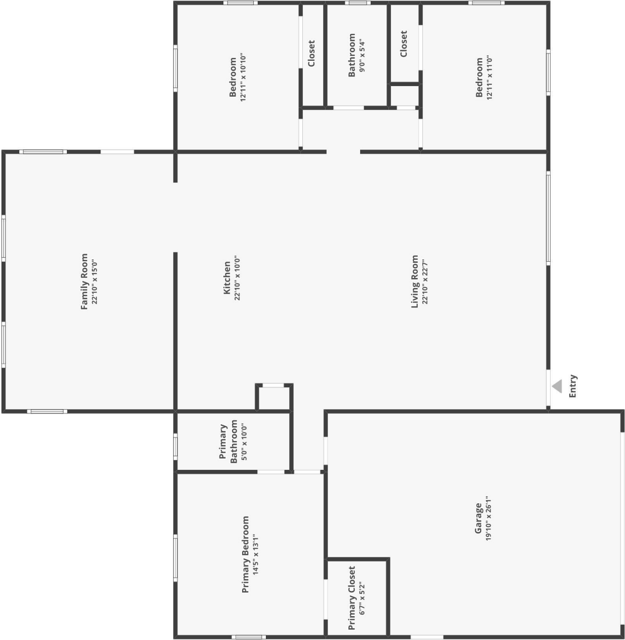
390 Harbor Dr, Cape Canaveral, FL 32920 Floor 1

Floor plans/tour cannot be used for building or design purposes. Sizes and dimensions are approximate.